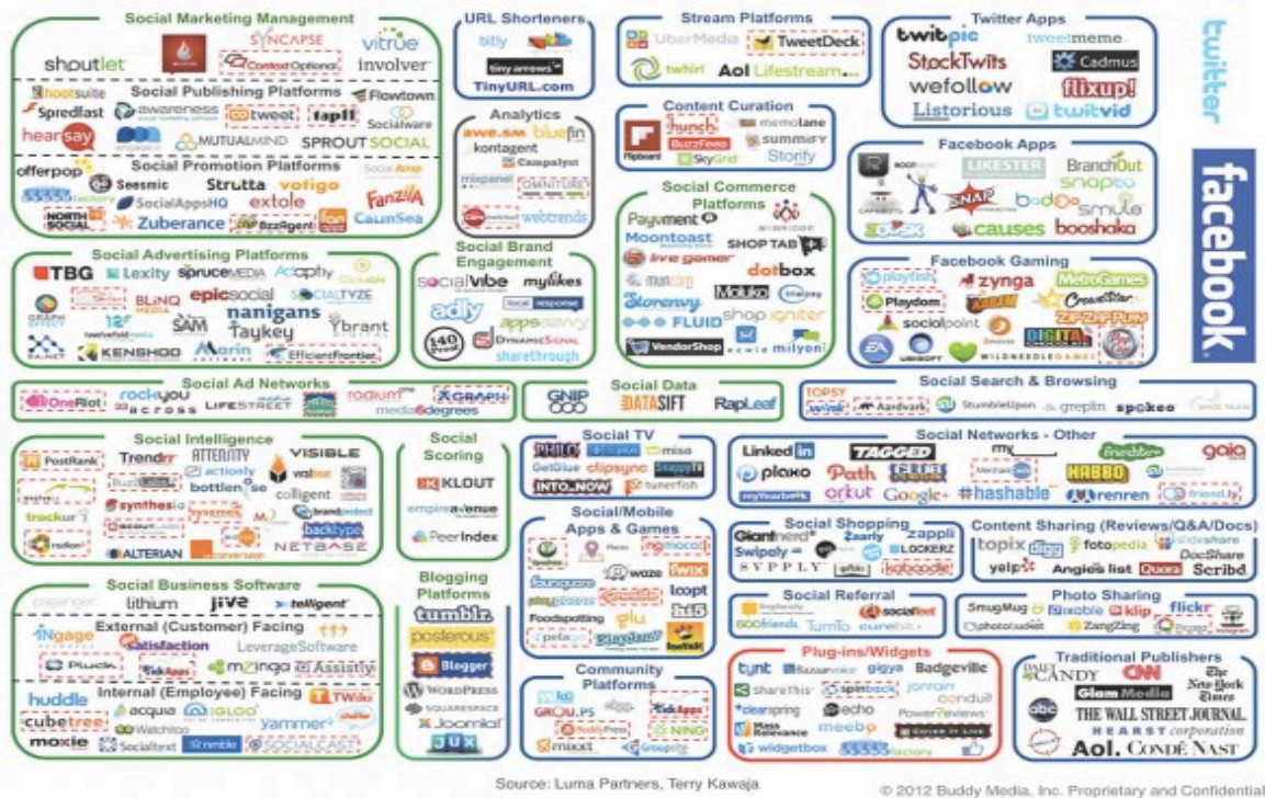
Figure 1: Complexity of Internet Marketing